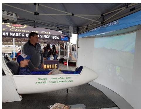
Analogue Mobile Simulator